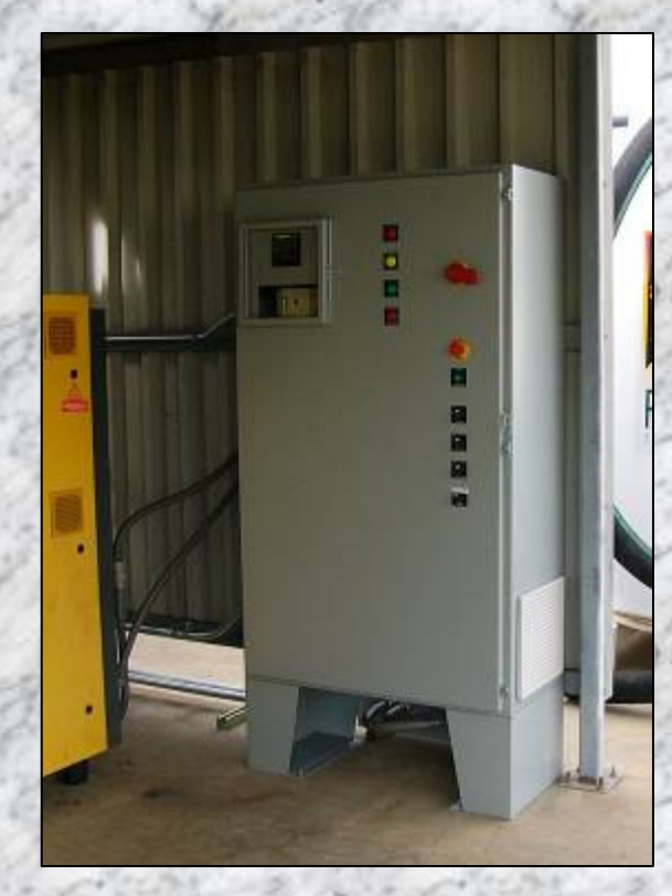
PLC Panel for SVES